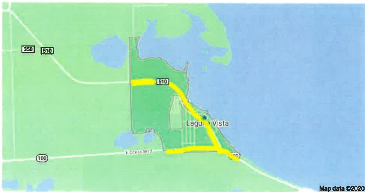
Laguna Vista City Limit Boundaries in yellow.

This district encompasses all land zoned Neighborhood Commercial on FM 510 and all land zoned General Highway Commercial on Highway 100. The district on Highway 100 will be the frontage lying within three hundred (300) feet of each side of the right-of-way of Highway 100 from the western boundary of the Town limits to the easterly side of the Town limits. The Laguna Vista Business District Overlay are boundaries are as follows: From the ETJ and City Limits of the Town of Laguna Vista from West on Highway 100 - 200 feet from the center of Hwy 100 north and south to east of ETJ on Hwy 100 200 feet from the center of Hwy 100 north and south and from Hwy 100 North to the city limits and ETJ of Laguna Vista on FM 510 ( Santa Isabel Blvd.) 200 ft from the center on East and West of FM 510 ( Santa Isabel Blvd). as displayed below: